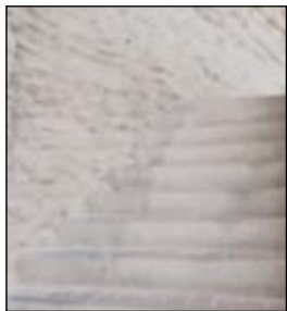
Contrast sensitivity and visual acuity loss